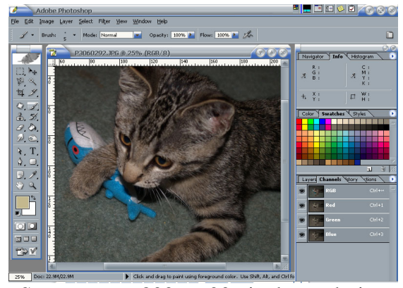
Screen set to 800 x 600 pixels resolution shows less editing area

The exercises in this series will use images that are small enough to not put a huge strain on your internet connection, though it is not uncommon for Photoshop users to work on individual image files that are hundreds of megabytes in size. Remember that the requirements listed above are a minimum only. A fast processor, fast graphics card, fast hard drive and plenty of RAM will greatly benefit any serious Photoshop user. A large monitor with your computer set to a high resolution is also handy as it gives you more room to work with when you are editing.