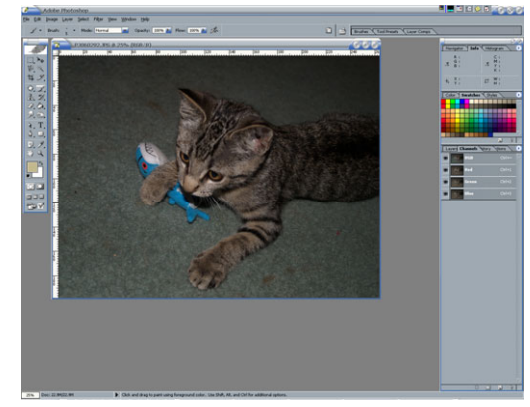
Screen set to 1280 x 1024 pixels resolution provides a lot more working space