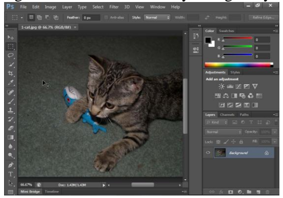
Screen set to 800 x 600 pixels resolution shows less editing area

The exercises in this series will use images that are small enough to not put a huge strain on your internet connection, though it is not uncommon for Photoshop users to work on individual image files that are hundreds of megabytes in size. Remember that the requirements listed above are a minimum only. A fast processor, fast graphics card, fast hard drive and plenty of RAM will greatly benefit any serious Photoshop user. A large monitor with your computer set to a high resolution is also handy as it gives you more room to work with when you are editing.