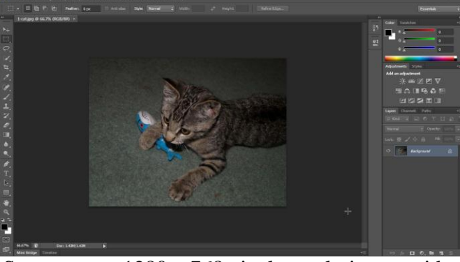
Screen set to 1280 x 768 pixels resolution provides a lot more working space